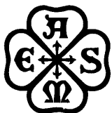
Director, Conformity Assessment