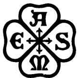
Director, Conformity Assessment